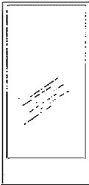
FULL GLASS STYLE