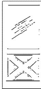
CROSS BUCK DESIGN

NOTE: Storm doors and windows shall not be installed, altered or replaced except as approved in writing by the ERB. The color of the storm door must be compatible with the home's color scheme. Please refer to the following Appendix B page, for acceptable door styles. Alternative door styles will also be considered.