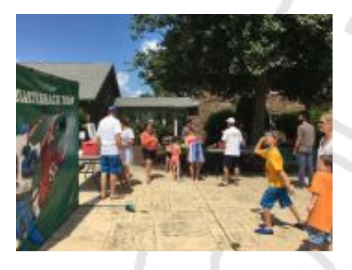
Block Party FUN!!